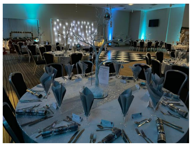
<u>Capacities</u> Room hire from - £1,500.00 – subject to dates and availability